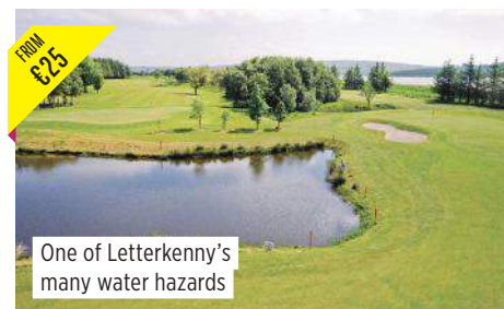
One of Letterkenny's many water hazards