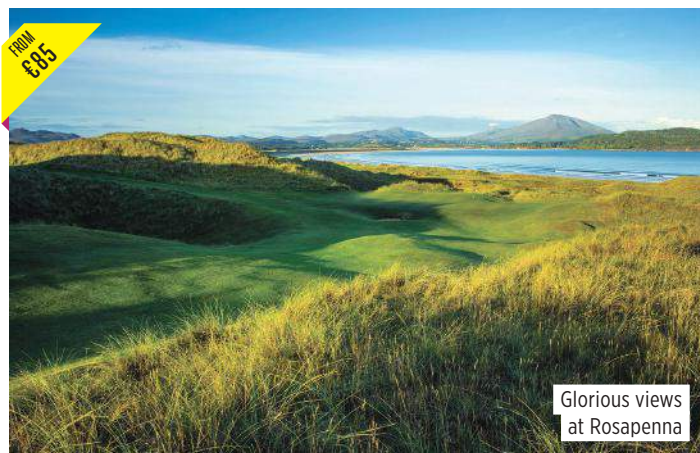
Glorious views at Rosapenna

GF: Round: €85–€110, discounts for hotel residents