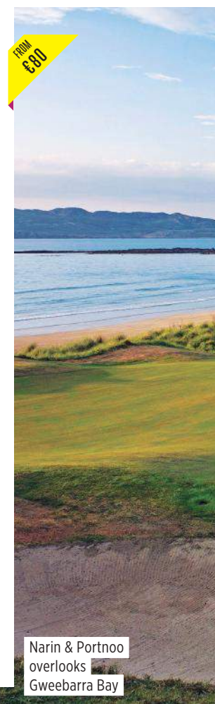
Narin & Portnoo overlooks Gweebarra Bay